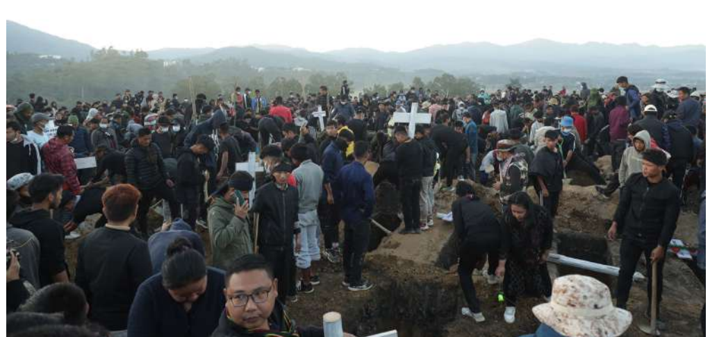
Coffin of martyrs reaches Kuki-Zo Martyrs Cemetery, Sehken, Lamka