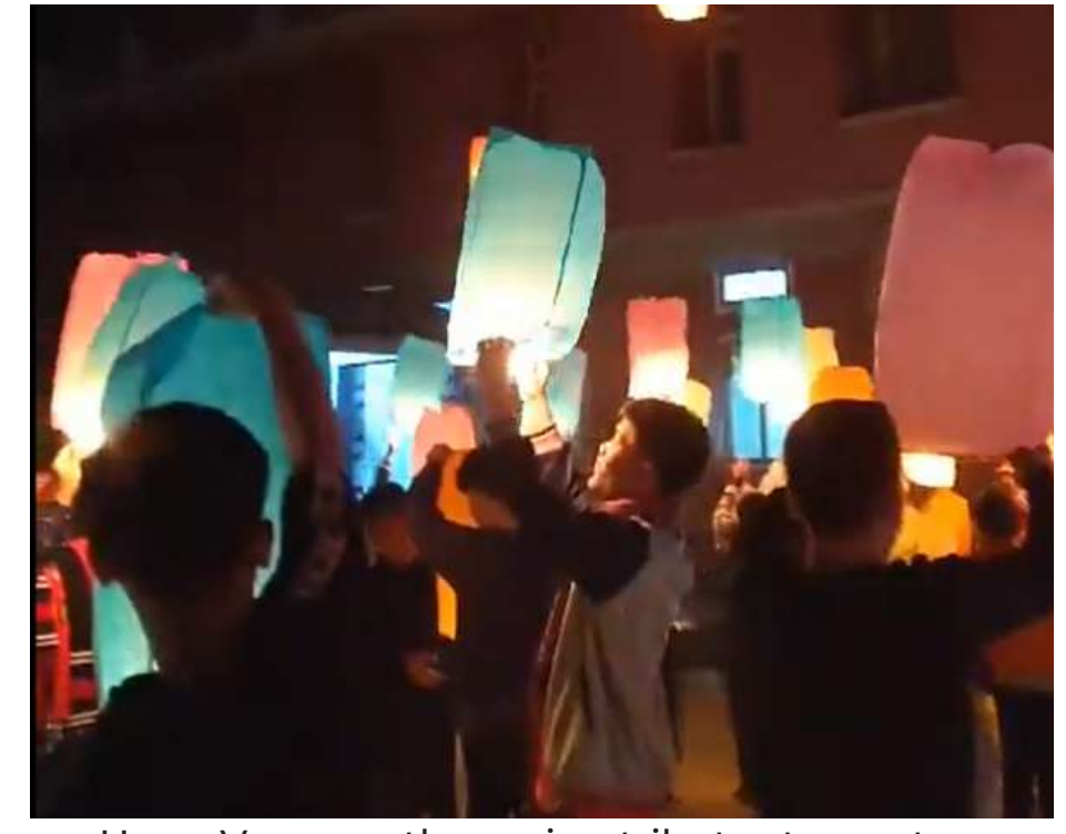
Hmar Veng youths paying tributes to martyrs