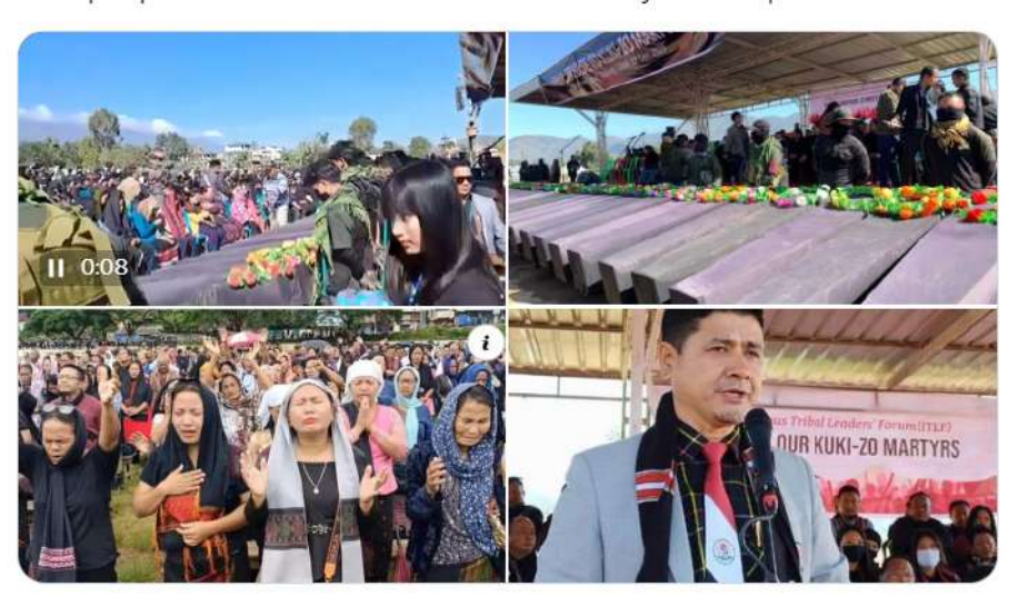
8:39 PM · Dec 20, 2023 · 111 Views

Earlier, a final tribute ceremony was held at Peace Ground, Tuibuang. The solemn occasion was marked by songs of condolence from Blessed choir, Joint Artist Assn etc. CYMA President affirmed that as long as the Mizo people have food to eat the Zo community in Manipur won't starve.