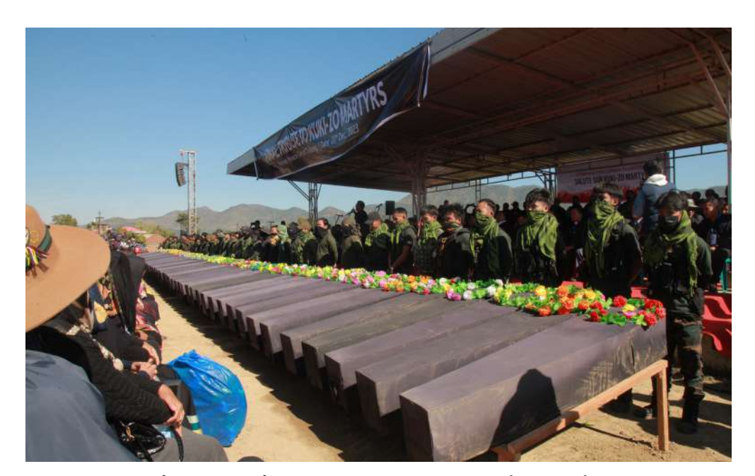
First Session at Peace Ground, Lamka