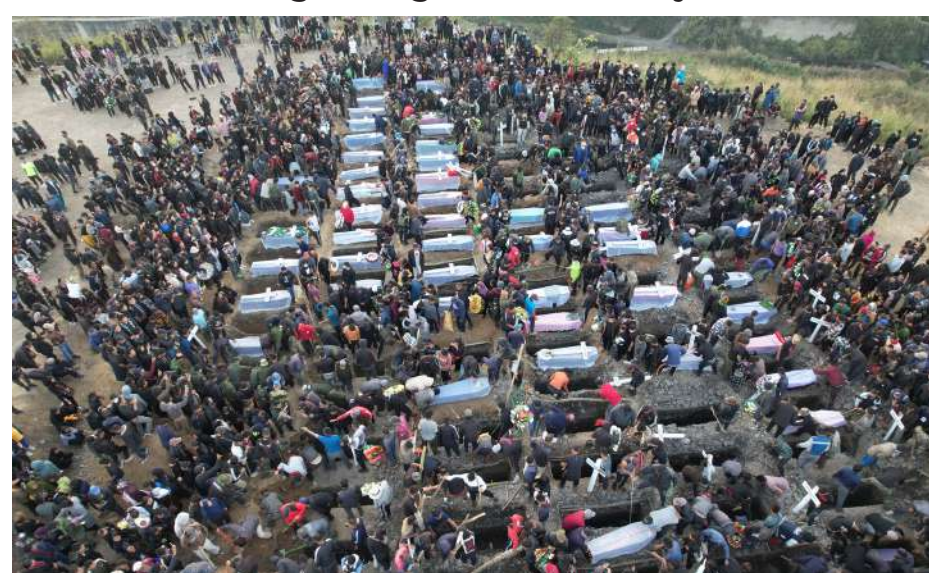
A drone footage of the mass burial service