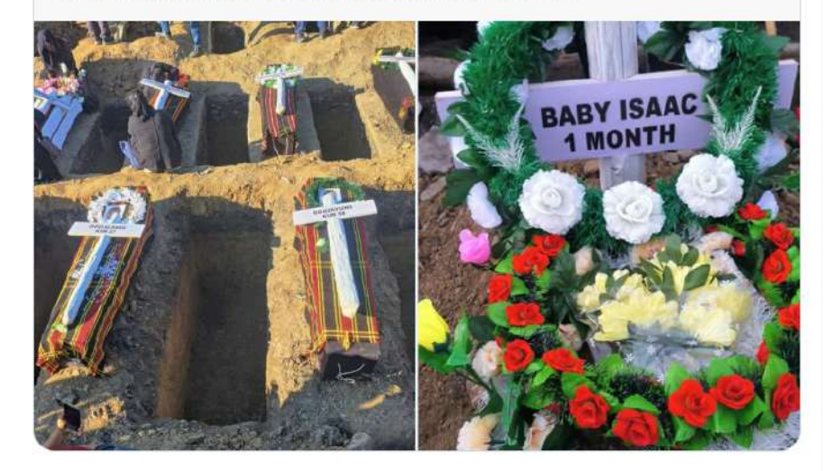
8:26 PM · Dec 20, 2023 · 11.5K Views

After 7 long months, 87 victims of #ManipurViolence finally laid to rest in #Churachandpur, one of them being a 1 month old child.