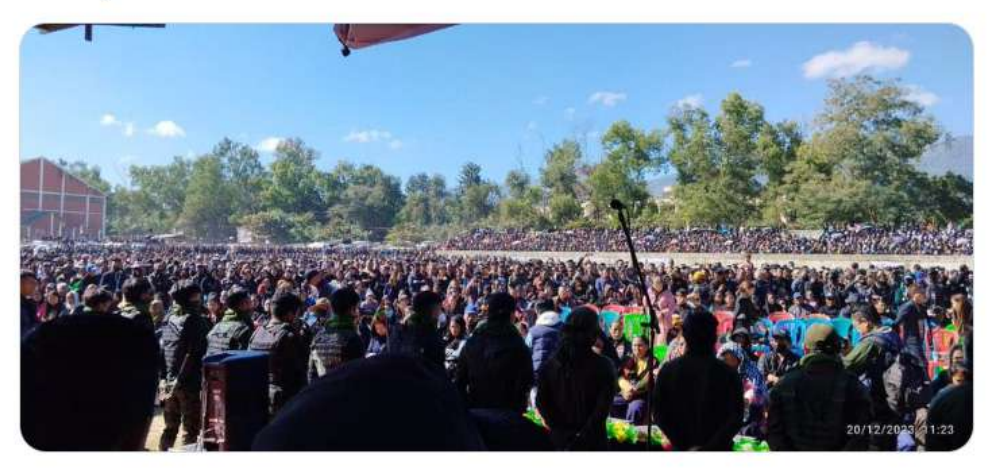
7:38 PM · Dec 20, 2023 · 8,001 Views