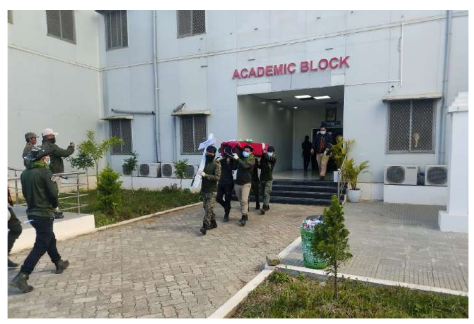
Coffins brought out from Mortuary