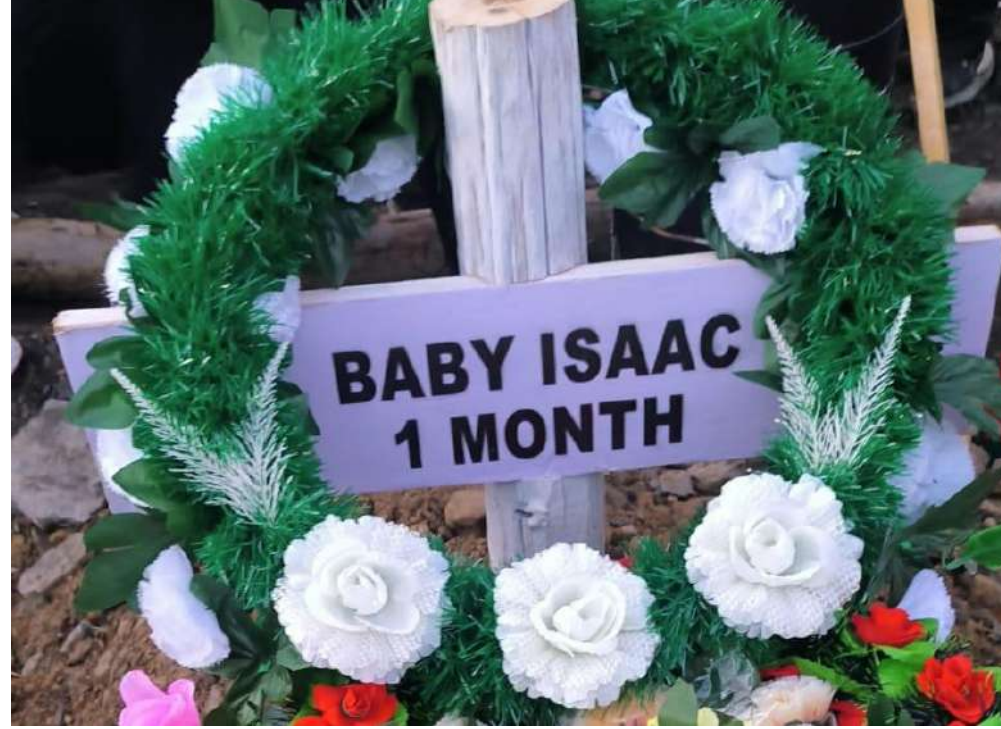
Burial site of the youngest victim, Baby Isaac