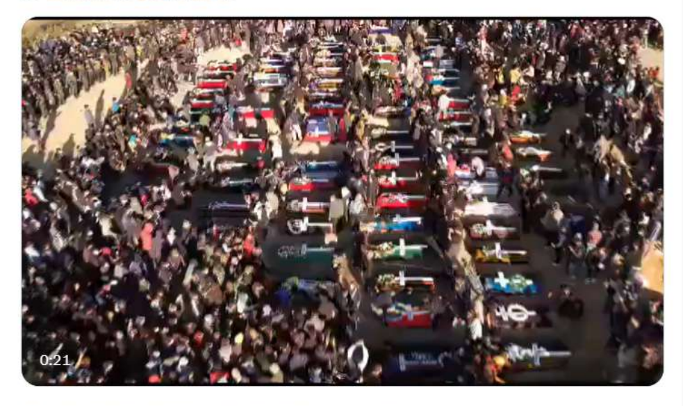
Last edited 4:57 PM · Dec 20, 2023 · 38.1K Views

#Manipur #ManipurViolence #DroupadiMurmu #JagdeepDhankhar #ParliamentSuspended