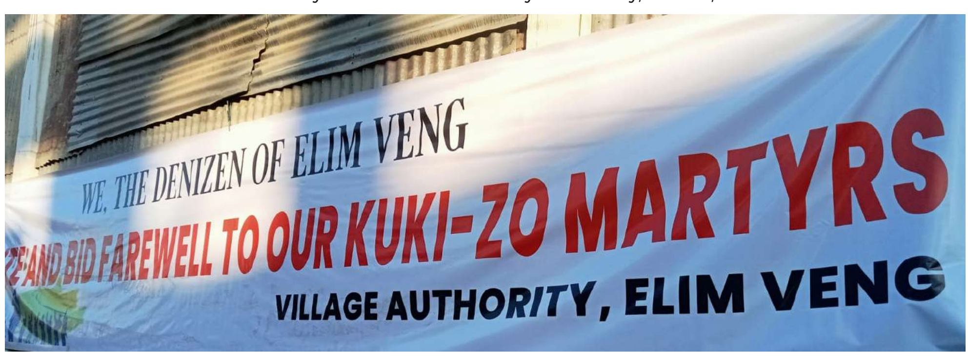
A road-side banner honouring Kuki-Zo martyrs at Elim Veng, Lamka