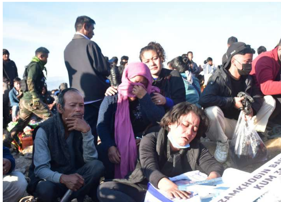
A grieving victim's family