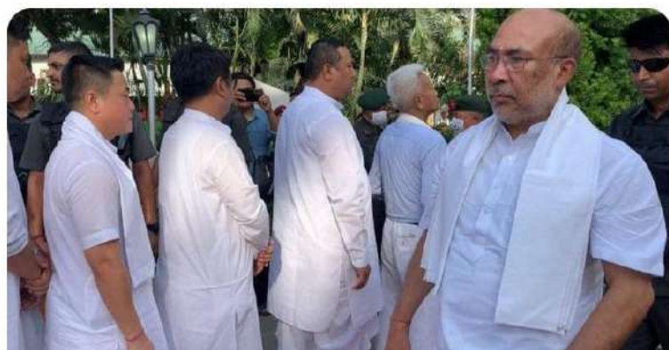
theprint.in 'Would gladly resign if it stops conflict, but there are reasons I must stay' — Manipur CM Biren...