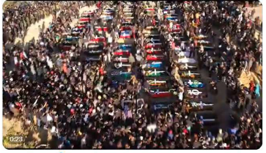
From Mojo Story 🤣