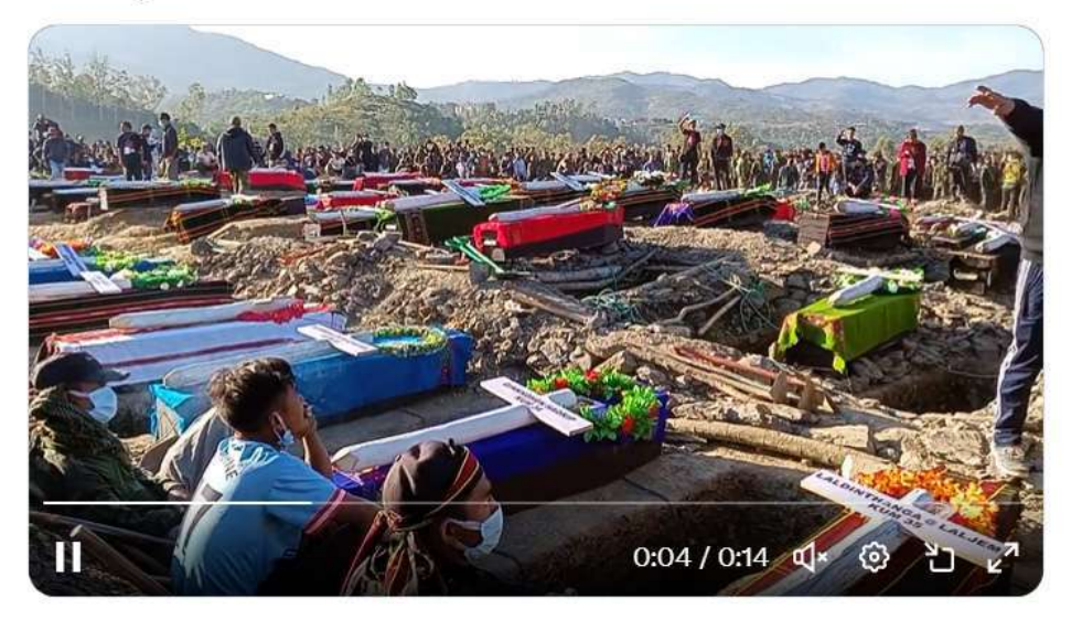
11:02 AM · Dec 21, 2023 · 171.2K Views

Story that must not get lost in parliament din: mass burial of 87 victims who died in ethnic violence in Churachandpur in Manipur. It's taken six months and a SC order. Who will hear the voices of the grieving? Who will bring closure?