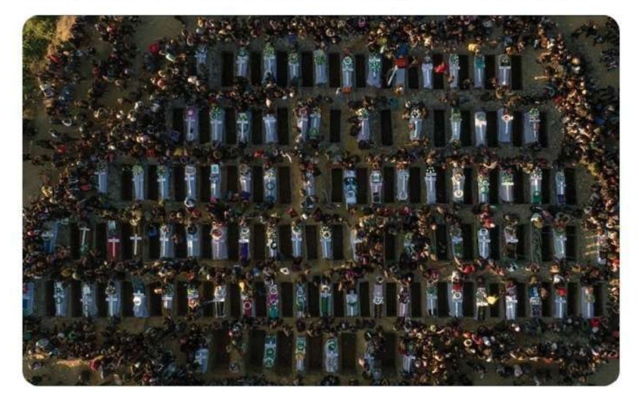
8:56 PM · Dec 21, 2023 · 597 Views

I say to all those leaders, do not look the other way. Do not hesitate... It is within your power to avoid a genocide of humanity. - Nelson Mandela