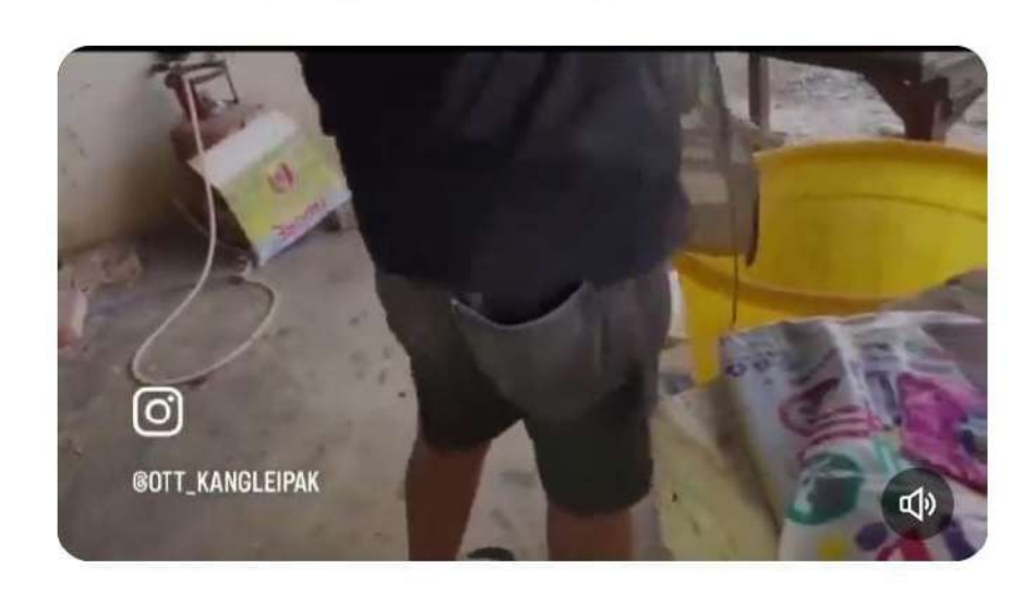
4:04 pm · 22 Mar 24 · 2,122 Views

Manipur: A woman shopper bargained the high price of chicken but the seller confronted her by showing his pistol & warned her. Such is the lawlessness in Manipur Valley. Due to looting PS, even a shopkeeper owns weapon now.