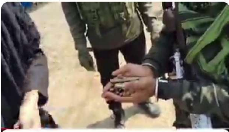
KUKI TUMNA HATNABA ARAMBAI NA SEM SABA LOIRE 🔥

@NIA_India Is Arambai's intel beyond reach?