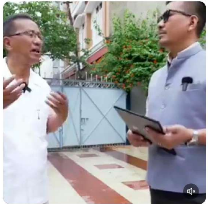
10:20 pm · 22 May 24 · 243 Views

Former CS of GoM m clearly stated that increase in number of villages of Kukis is due to customary practices and because of MNREGA. He failed to add the transfer of villages due to Kukis Naga conflict. Narco (as confirmed by Brinda) Biren's narrative debunked. @PMOIndia