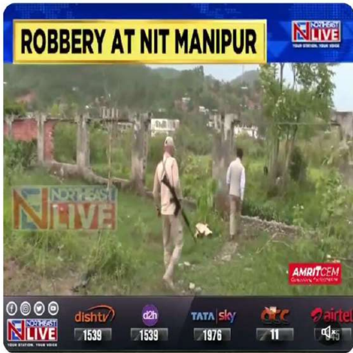
5:29 pm · 22 May 24 · 921 Views

From mass looting Kuki-Zo houses/properties to stealing the bricks of a standing wall, Meiteis have done it all. This shows the lawlessness.