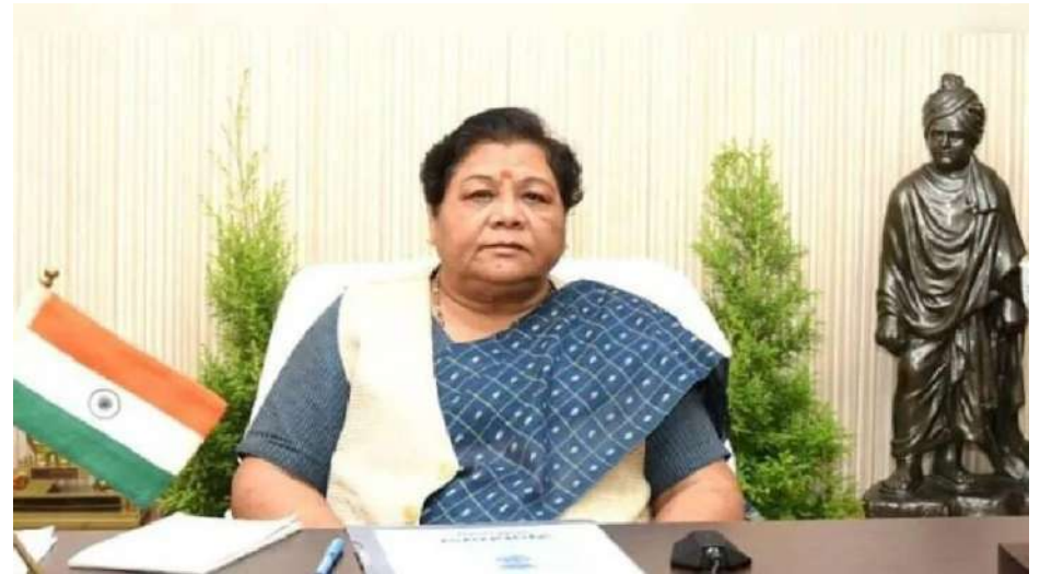
Pic: Manipur Governor Anusuiya Uikey

Meckle Tea India Private Limited, Manipur's proposal for large scale tea plantation in the State as an alternative