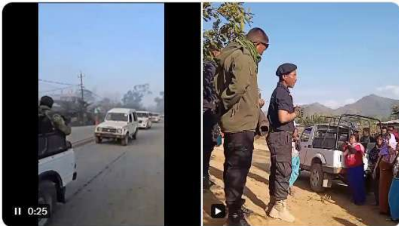
7:46 PM · Jan 24, 2024 · 2,338 Views

@narendramodi @AmitShah @blsanthosh @sambitswaraj @IndiaTodayNE @vijaita @EastMojo @CNNnews18