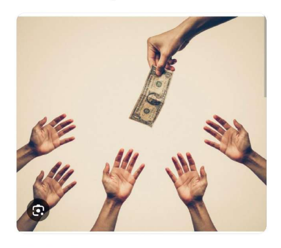
22:35 · 24 Aug 24 · 282 Views

The saddest thing is we have representative/leaders who cannot see beyond vote bank politics. A true leader with legendary vision can never be cow down by public pressure, if they do they are just an opportunist. We have 3 opportunists, their well-being above the community.