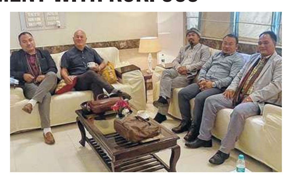
Sarma and the members of the Assam Legislative Assembly for this gesture.

In other news, Chief Minister Singh expressed his appreciation for the Assam Legislative Assembly's recent decision to recognize Manipuri as an associate state language in four districts of Assam. He extended his gratitude to Assam Chief Minister Himanta Biswa