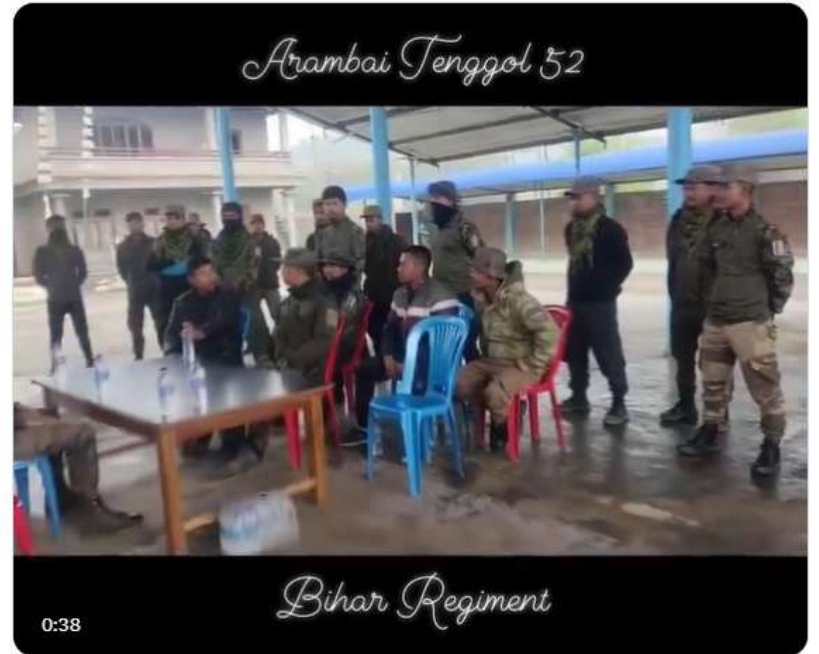
1:32 PM · Sep 23, 2024 · 8,124 Views

@SamKhongsai_ #MeiteiMilitant #ManipurVoilence