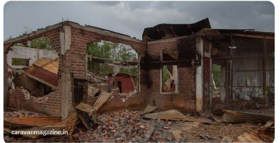
9:15 PM · Dec 24, 2023 · 419 Views