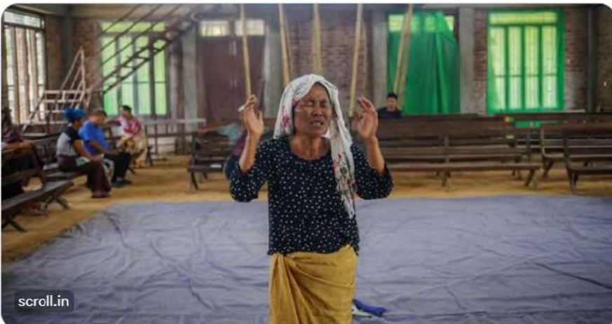
11:39 PM · Dec 23, 2023 · 4,012 Views

"Manipur has fallen off the national conscience" @harsh_mander on the carnage, suffering & the new border between the Meitei valley & Kuki hills in Manipur 7 months later In grief-struck relief camps, songs and prayers heavy with suffering scroll.in/article/106075... via @scroll_in