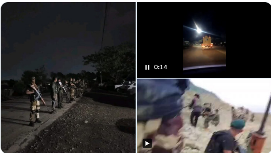
8:05 AM · Apr 25, 2024 · 1,240 Views

@PIBHomeAffairs @AmitShah @RahulGandhi @adgpi @official_dgar @ANI @EastMojo @htTweets @KSO_tlm @nytimes @PTI_News @thewire_in @timesofindia