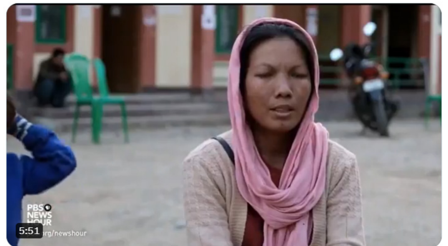
1:11 AM · Apr 25, 2024 · 126.6K Views