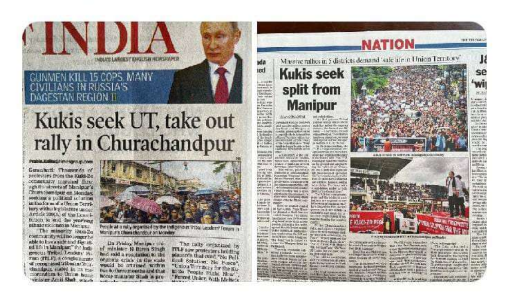
12:14 pm · 25 Jun 24 · 3,653 Views

Times of India and the telegraph says the truth. Kukis needs separate administration for humanity. #Manipur