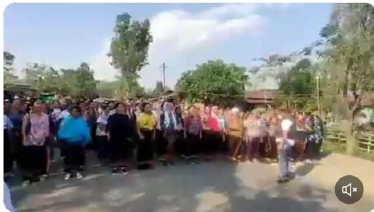
7:34 pm · 26 Apr 24 · 12.2K Views

The decision of the Central Government to withdraw the Central Armed Forces from the most sensitive buffer areas amid the ongoing tense situation in Manipur is unfair. After this move of the government, attacks on Kuki tribals are being seen again in the state. The Kuki community is registering protest against this. #Manipur