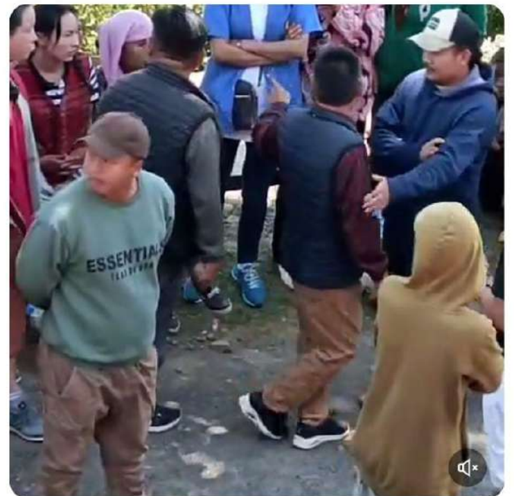
3:18 pm · 26 Apr 24 · 140K Views

These are the most important elections of our lifetime