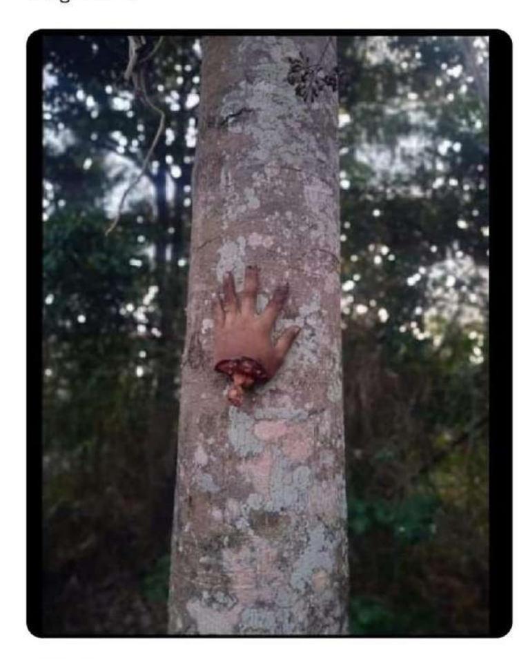
20:51 · 26 Aug 24 · 10.4K Views

Somewhere in Manipur. The atrocities that we hear are 10%. The reality of cruelty is more than imagination.