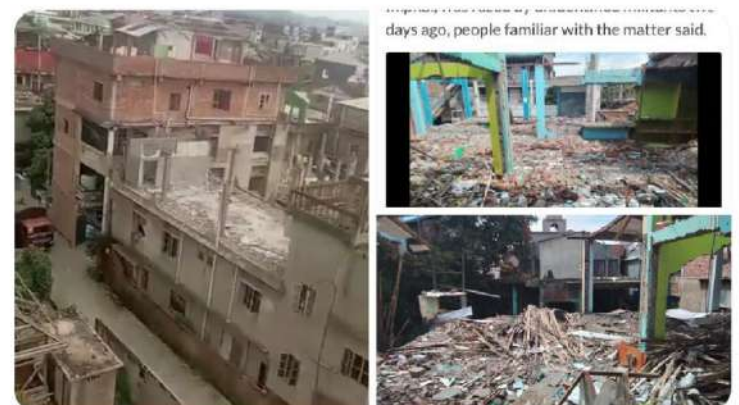
10:16 · 27 Sept 24 · 2,018 Views

The failure to protect KukiZo properties is a direct violation of the Supreme Court's order. KukiZo homes are still being destroyed in Imphal under a broad daylight. What will it take for the govt. to act? @manipur_police Where are you now? This is New Lambulane right at the heart of Imphal. @NIA_India @CBIHeadquarters @jeegujja @SamKhongsai_ @haokipkim128 @RavinderKapur2 #MeiteiAtrocities #MeiteiWarCrimes #ProtectKukZoProperties