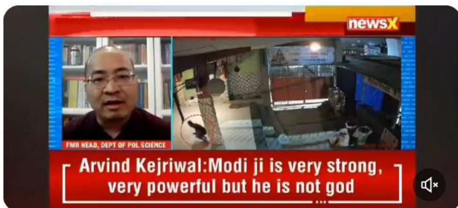
14:21 · 27 Sept 24 · 1,650 Views

My 2 cents @NewsX on the deliberate misinformation campaign to malign the Kukis as a threat to 'national security'. Now that the CM's office inverted its own ghost story its earlier claim of drone bomb & rocket attacks are anything but to deflect attention on #ManipurTapes