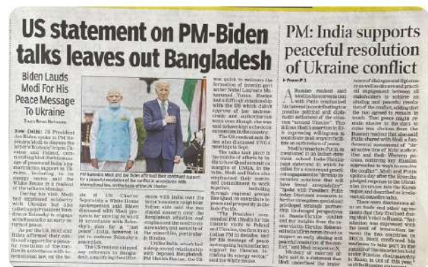
9:02 · 28 Aug 24 · 5,558 Views

#Manipur has been burning for nearly 2 years. Genocidal war is raging on #BangladeshHindus in our neighbourhood. But Modi is incapable of handling let alone resolving them. Yet, he wants to end Russia-Ukraine War.