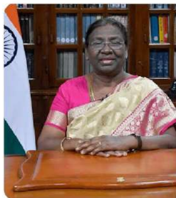
19:57 · 28 Aug 24 · 17.5K Views