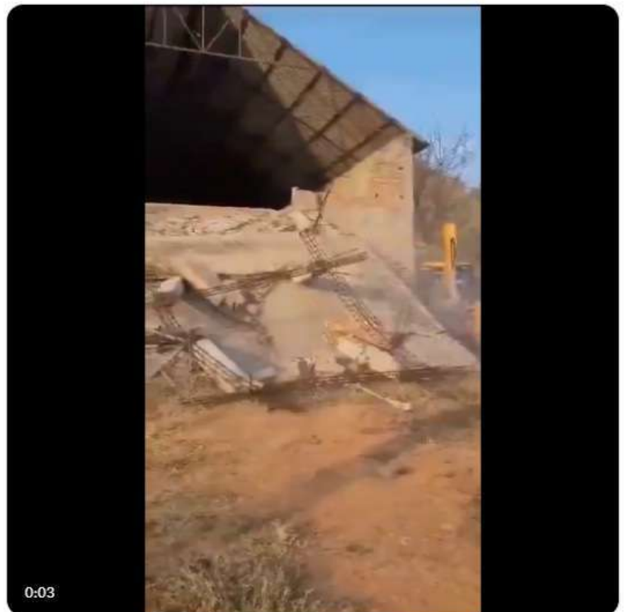
3:56 AM · Jan 29, 2024 · 4,048 Views

@AJEnglish @ANI @Pontifex @BillyGraham @amnestyusa @BishopBarron @UN_HRC @UN @BBCNews @POTUS