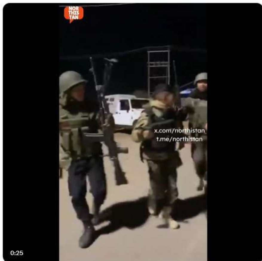
11:45 AM · Jan 29, 2024 · 4,597 Views

India - Manipur's CM, Biren Singh, claimed militants returned weapons for peace, but Arambai Tenggol militias, armed with looted weapons, are seen dancing in uniform.