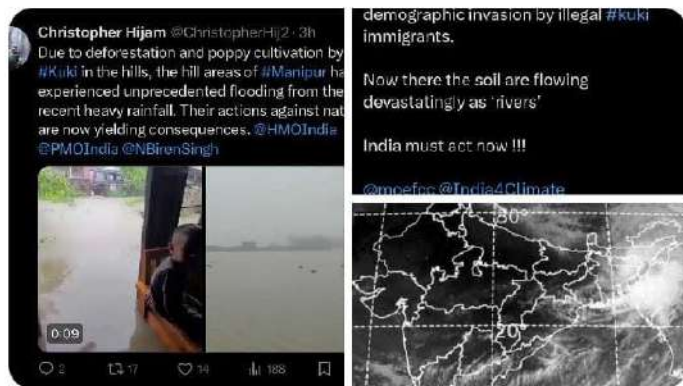
BBC News (UK) and 9 others 1:06 am · 29 May 24 · 2,636 Views

#MeiteiAtrocities #MeiteiAggression #MeiteiTerrorists @moefcc @India4Climate @greenpeaceindia @CSEINDIA