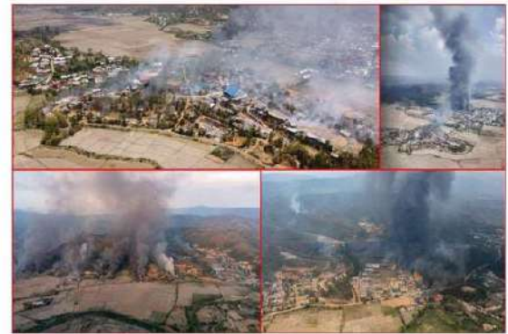
28.05.2024: Exactly one year after Manipur Valley was devastated by cyclones and floods.