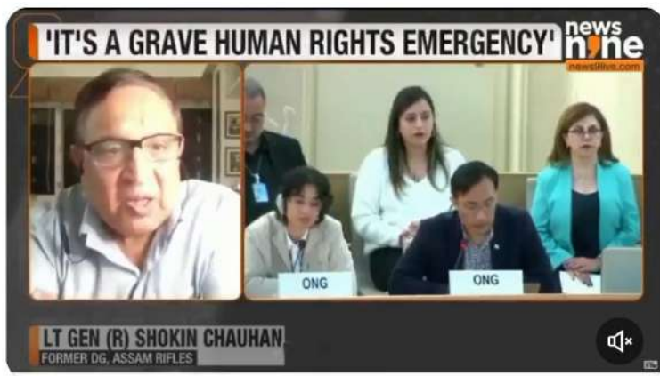
21:02 · 30 Sept 24 · 975 Views