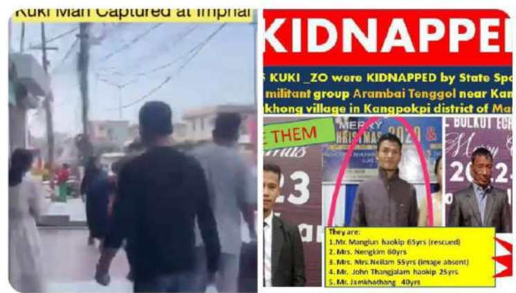
10:56 · 30 Sept 24 · 1,748 Views

@manipur_police Where was MP that day? #MeiteiWarCrimes #MeiteiAtrocities #ManipurViolence