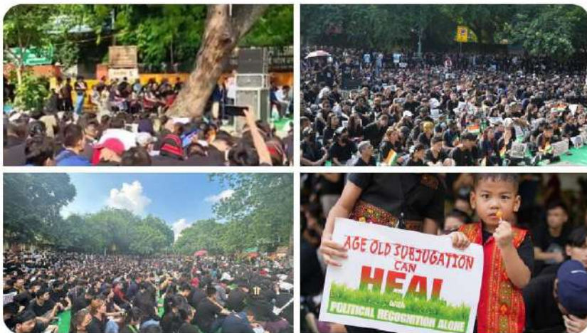
23:34 · 31 Aug 24 · 1,652 Views

The significant protest by the Kuki Zo tribals from Manipur at Jantar Mantar today has not received adequate media coverage. Ignoring their struggle and demand for justice is not only unjust but also a failure of social responsibility. #JusticeForKukiZo