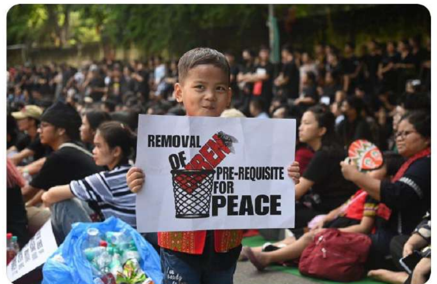
21:37 · 31 Aug 24 · 254 Views

A child protester from the Kuki-Zo community holding a placard in Delhi's Jantar Mantar on August 31, demanding action against Manipur Chief Minister N Biren Singh over an audio clip in which he purportedly "declared his involvement in spearheading violence" in the state.