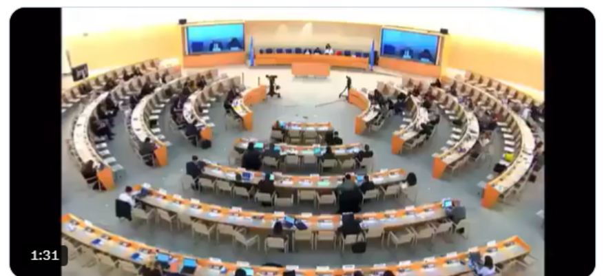
10:19 PM · Oct 2, 2024 · 511 Views