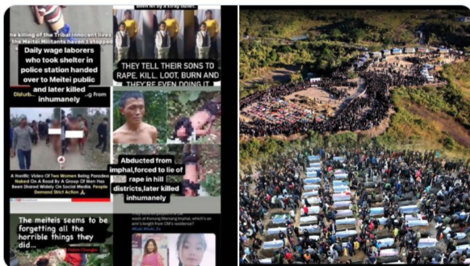
8:17 PM · Oct 2, 2024 · 898 Views