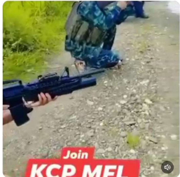
14:18 · 11 Oct 24 · 1,812 Views

#Meitei terrorist group KCP-MFL is openly displaying foreign weapons, including the 5.56mm INSAS LMG, which originates from the Indian Ordnance Factory in Jabalpur. How did these weapons end up in the hands of this banned group in Myanmar's Kabaw Valley, and who will be responsible for their retrieval? #VettaiyanTheHunter #dkpol #DurgaPuja2024 #SEUNGHAN #kärnten #CARV #Chile #ChilevsBrasil #Maynata #dkpol