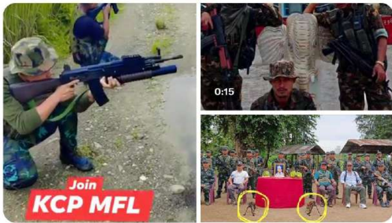
16:00 · 11 Oct 24 · 908 Views