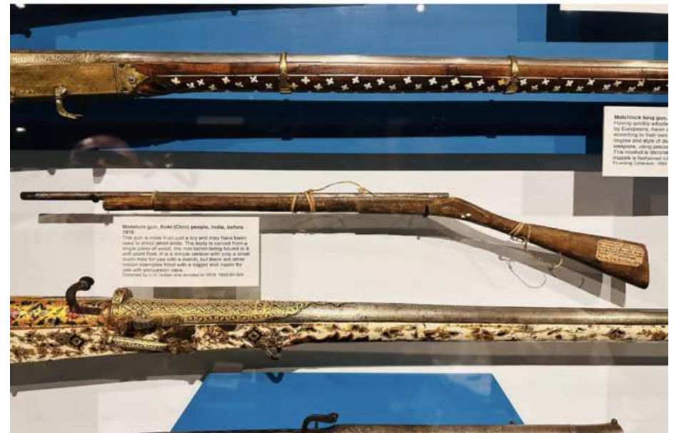
Miniature gun, Kuki (Chin) people, India, before 1918.