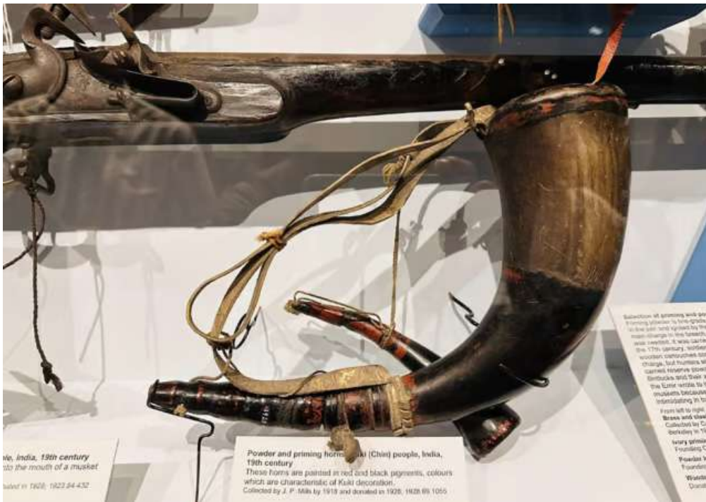
India, 19th century to the mouth of a musket dated in 1928; 1922.84.432