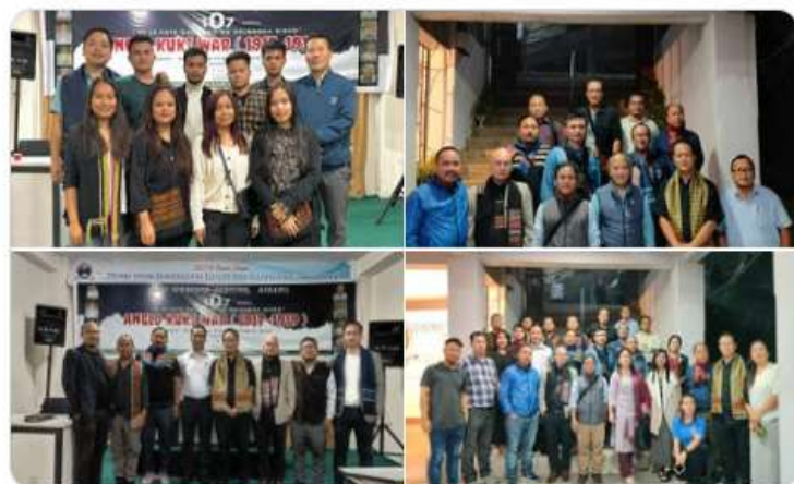
7:53 AM · Oct 19, 2024 · 1.094 Views

#AngloKukiWar #AngloKukiWar1917 #Kuki @Chengchengpi @haokipkim128 @SamKhongsai_ @Bec_Eimi to