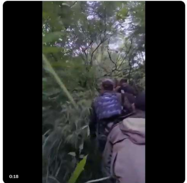
1:35 PM · Oct 23, 2024 · 3,907 Views

#Meitei group #ArambaiTenggol has started infiltrating into #Kuki areas. If this continues expect another round of conflict will start soon between the #Kuki and #Meitei communities and this will further make the situation worse. #Garime #TheRajaSaab #LingOrm #ViratKohli #degerforsif #dkpol