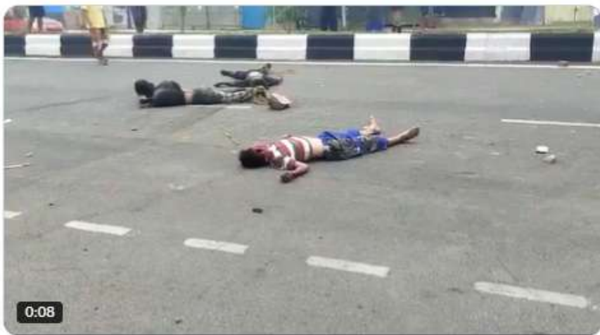
1:00 PM · Oct 24, 2024 · 1,440 Views

Wanton killings of innocent labourers in Imphal by #MeiteiTerrorists stands a good reminder that Kukis and Meiteis can never live together again. #SeperateAdministration is the only solution, nothing else! #MeiteiWarCrimes @Chengchengpi @EstherEimi @SamKhongsai_ @haokipkim128 @Bec_Eimi