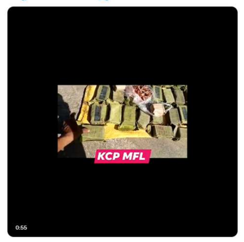
10:44 AM · Oct 30, 2024 · 1,325 Views