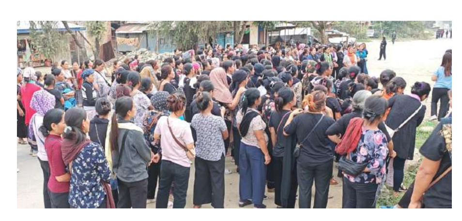
significant challenge for Manipur's path to stability and reconciliation.

For many in the Kuki-Zo community, the protest served as both a message and a defense against perceived aggression. "We will not allow provocations in our land," one protestor asserted. As regional divisions continue to intensify, the impasse between state leadership and tribal communities signals a