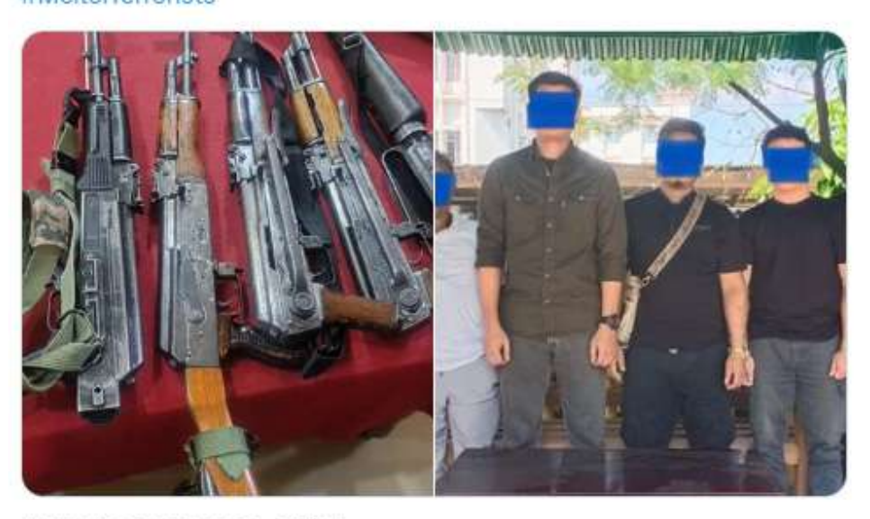
11:06 AM · Oct 30, 2024 · 557 Views