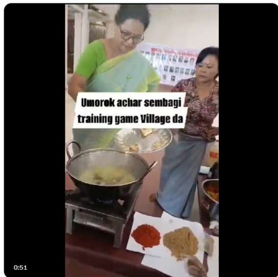
11:38 PM · Oct 30, 2024 · 2,249 Views

EBC Church, a Kuki Zo Christian Church located at Zone-3, National Games Village, Imphal West-795004, the first Church to be Vandalised and burnt by Valley Meitei Radicals on night of 3rd May 2023, now being used as if it were their own personal property.