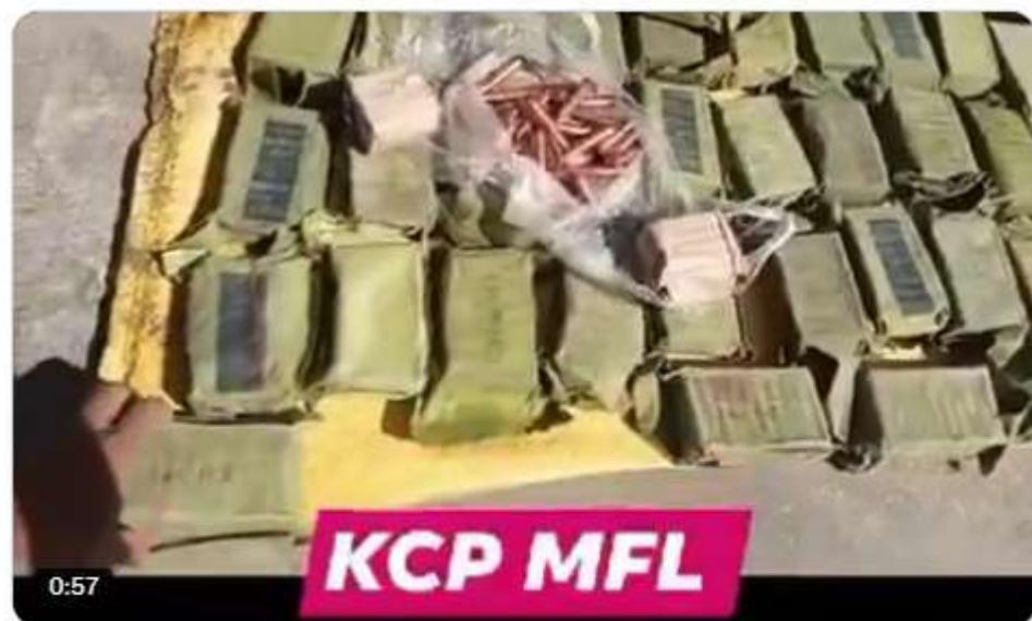
10:02 AM · Oct 30, 2024 · 774 Views