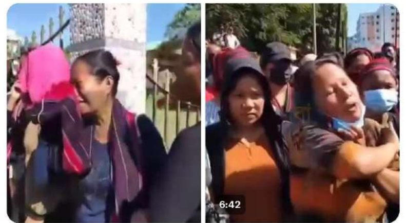
15:29 · 16 Nov 24 · 2,521 Views