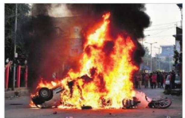
Vehicles set on fire by protesters over the recent killings, in Imphal West, Manipur, on Saturday.