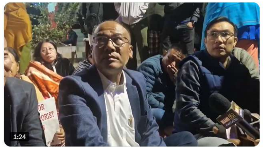
8:38 AM · Nov 20, 2024 · 2,841 Views

@rashtrapatibhvn @INCIndia @INCManipur @manipur_police @ImphalTimes @ImphalFreePress @ImpactTvManipur @TOMTV2019 @the_hindu @thewire_in @News9Tweets @htTweets