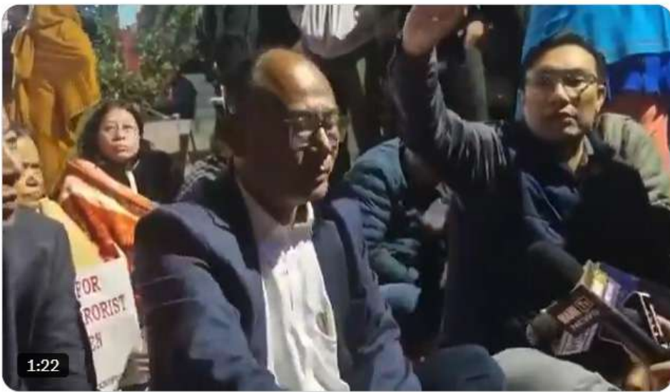
9:28 AM · Nov 20, 2024 · 3,616 Views