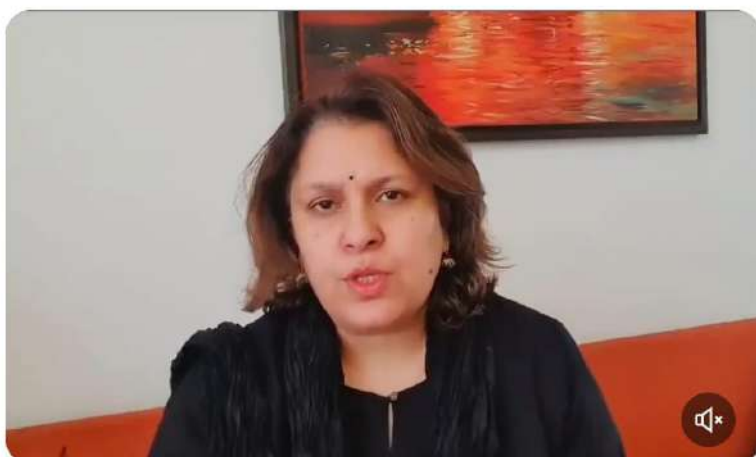
19:44 · 22 Nov 24 · 850 Views