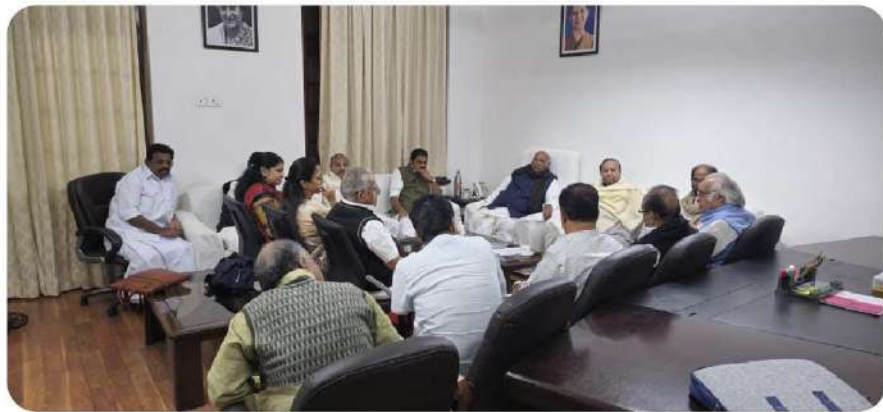
11:03 · 25 Nov 24 · 18.9K Views

As Parliament reconvenes, INDIA Alliance leaders held a strategy meet in INC President Sh. Mallikarjun @kcharge ji's office. The people are suffering under the BJP's rule, be it in Manipur, the rising unemployment, the communal clashes across India, or due to Adani's mega corruption. We vow to speak on their behalf and raise their voice in Parliament this session.