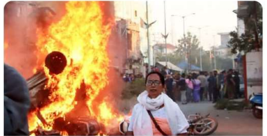
frontline.thehindu.com Manipur Mayhem 2024: Violence Escalates in Jiribam Despite Peace Deals

What is this "Jiribam new epicenter of violence in Manipur" rubbish that agencies are floating? In JUNE, the Arambai Tenggol had used fake news to instigate mobs, burn down houses/churches, abducted a Vaiphei man who