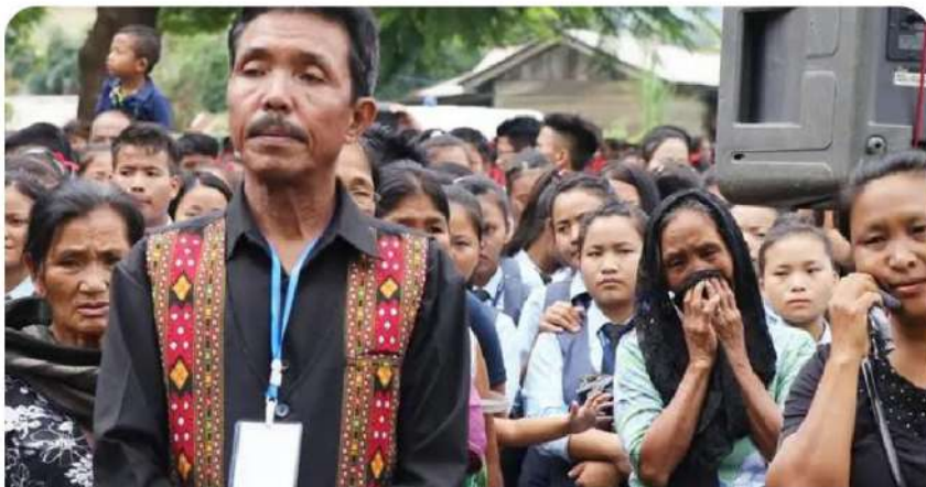
indianexpress.com '1,000 Kukis from Manipur came here': In Assam's Karbi Anglong, new claim and new row

Just spoke to the DC of West Karbi Anglong who said there's no permanent settlement of Kukis in the district. About a 100 had come to celebrate their harvest festival and went back. Also to note: Not one reporter called her to fact check this claim