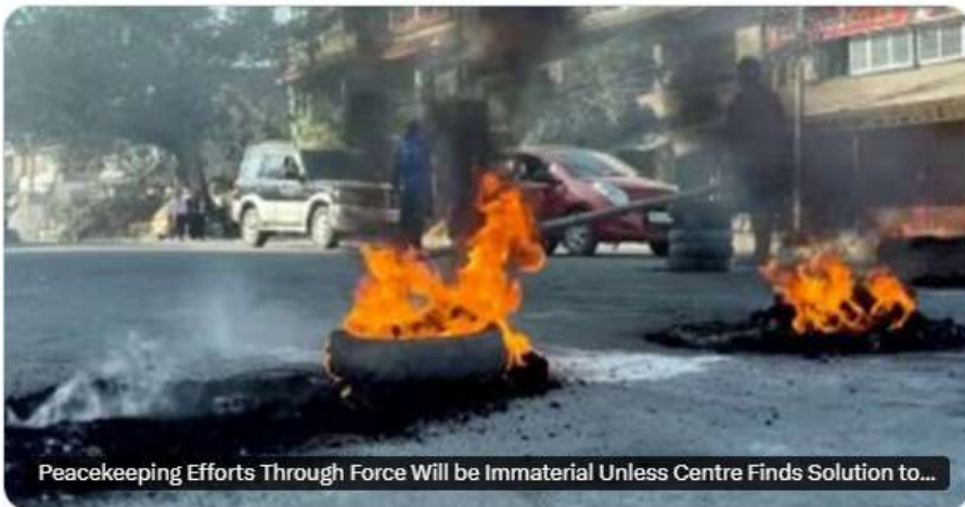
Peacekeeping Efforts Through Force Will be Immaterial Unless Centre Finds Solution to...

#ManipurViolence @RasushAnkita @iamharmeetK @lam_amby