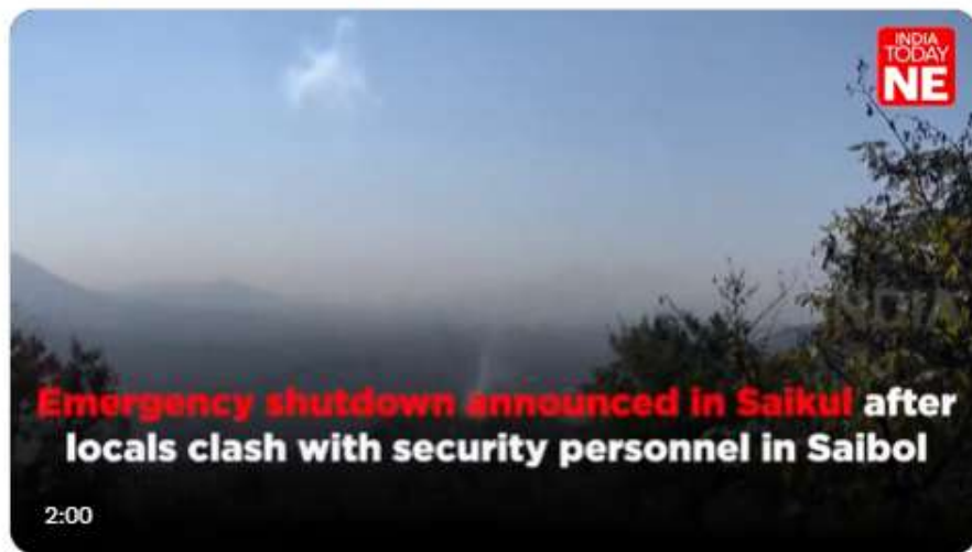
2:21 PM · Dec 31, 2024 · 2,275 Views

#ManipurViolence #Emergency #ShutDown #Northeast #IndiaTodayNE